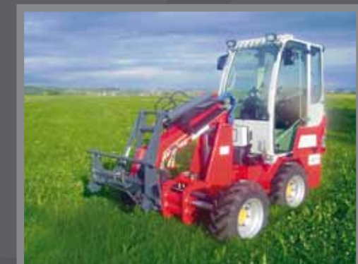
For working outdoors and optimized security the K3 is also available with a comfort cabine.