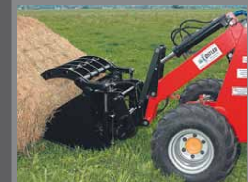
Thanks to the tool holding fixture, which meets the DGS Euro standard, commercially available tools can be used.